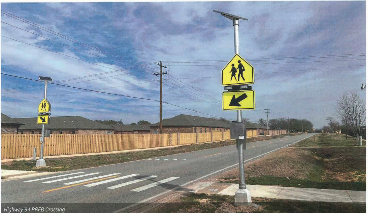
Highway 94 RRFB Crossing

with individual communities participating in regional programs, attending trainings or meetings convened at the regional scale, or implementing regionally developed programs at the local level. Recommendations specific to the Six E's (Engineering, Education, Encouragement, Enforcement, and Evaluation (with Equity considered broadly through all)) are found below. Economy is included as an additional category to help demonstrate the benefits of implementing all of the E's. Refer to Appendix D for detailed guidance on implementing each item, including a description of recommended actions, regional and local roles, as well as sample programs.