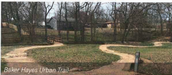
Baker Hayes Urban Trail