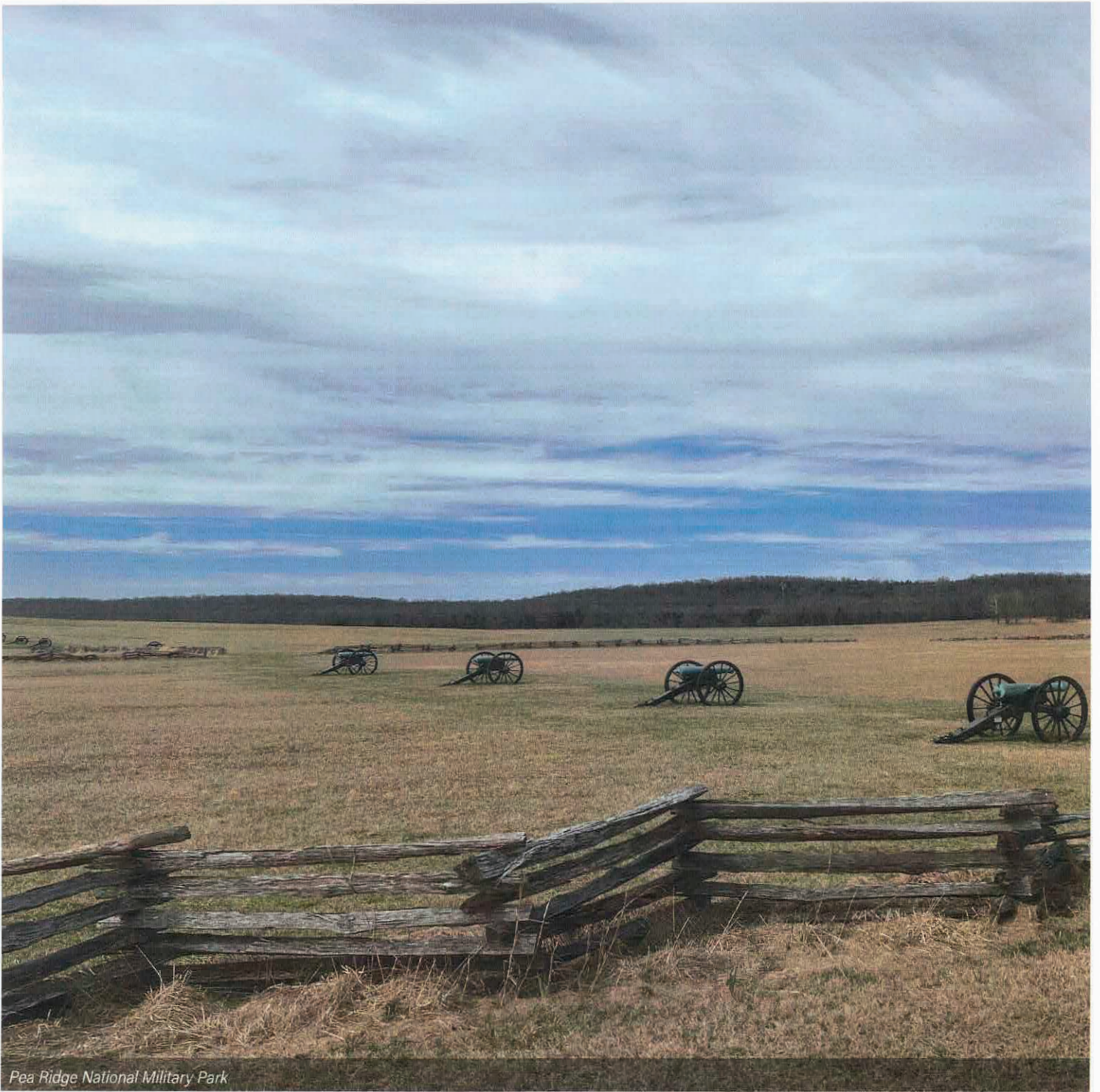
Pea Ridge National Military Park