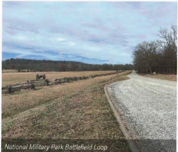
National Military Park Battlefield Loop

Pea Ridge is a rural community that has a population of 7,140 and covers 8.94 square miles in northwest Benton County. Neighboring communities include Bella Vista to the west (12 miles to the center), Little Flock to the south (7 miles to the center), Bentonville to the southwest (10 miles to the downtown), and Rogers to the south (9 miles to downtown). Pea Ridge National Military Park is a regional destination and Civil War battle site a few miles east of Pea Ridge. Pea Ridge is characterized by an older downtown center where commercial activity was once focused (and still is to an extent) along with a newer commercial strip found at the Lee Town Road and Curtis Avenue intersection. Pea Ridge is growing with residential and commercial development steadily increasing. Key opportunities will include improving connectivity to local destinations such as the schools, downtown, commercial centers, local parks, museum, library, trail system, Pea Ridge Military Park, and surrounding communities.